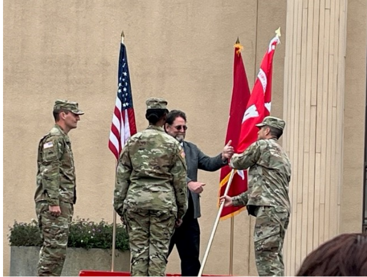
Official Changing of the Command, Friday, June 23rd, 2023.