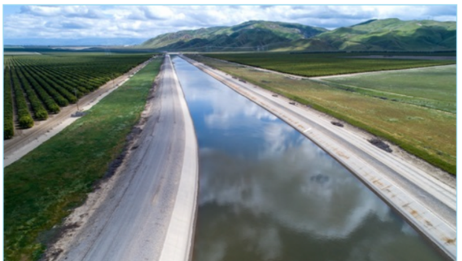
A drone provides a view of a section of the California Aqueduct within the California State Water Project, located near John R. Teerink Pumping Plant.