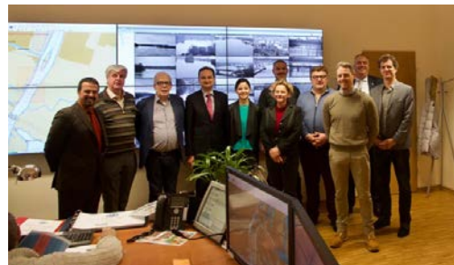
InCom Working Group 125 in Szczecin, Poland