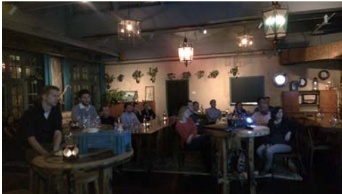
Working Group Evening Event in the Netherlands