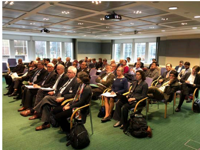
79th Council Meeting on 2 February 2018

The following Statutory Matters were discussed and approved by both the ExCom and Council members: