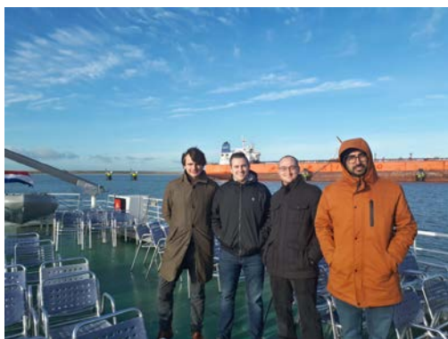
Boat trip through the Port of Rotterdam

Before the YP-Com meeting in the Belgium, a few members of the commission joined the World Port Center on 29 January at the headquarters of Port of Rotterdam, followed by a visit to Futureland in Maasvlakte 2, where they sailed through the port complex in the afternoon. After the sailing technical visit, YP-Com also visited Maeslant Storm Surge Barrier in Rotterdam. This was all possible thanks to the support of Port of Rotterdam and all our core PIANC members working there.