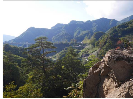
Site of reservoir

After the site visit, the group stayed at a ryokan - a traditional Japanese inn - in nearby Kusatsu Town, a famous hot spring area. The YPs enjoyed a spa, tatami mats and kai-seki - a banquet of Japanese formal dishes and sake for a traditional social gathering. The following day, the group convened to discuss forthcoming events and for YPs to present two new technologies: 1) a 3-D tsunami simulation using artificial intelligence and 2) a construction method for leg-type offshore breakwaters.