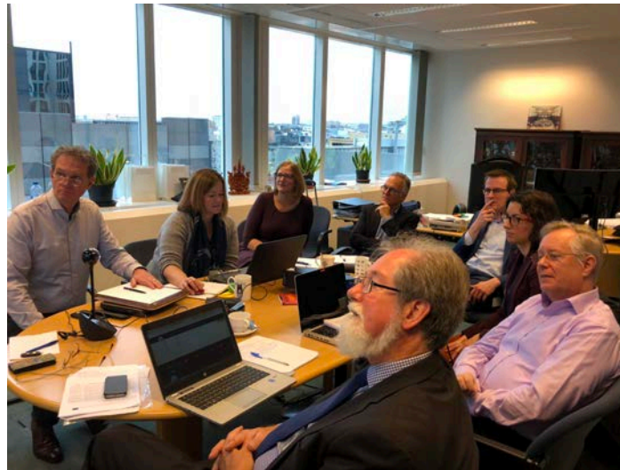
ProCom meeting on 29 January 2018