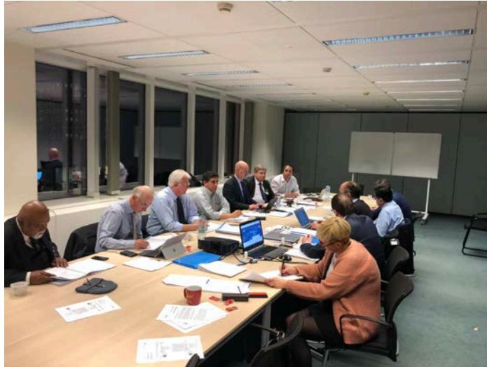
ExCom Meeting on 31 January 2018

The ExCom ran through the Minutes & Action Points of the previous meeting and new Terms of Reference (ToR) for new Working Groups reports were discussed, as well as the current Status of Working Groups . The different Commission Chairs reported on their last Commission meeting .