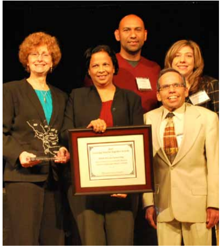
City of Union City Award Winners