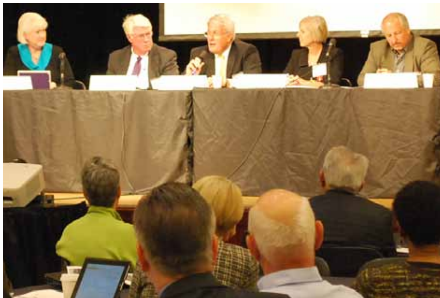
Preparing for 2050 panel