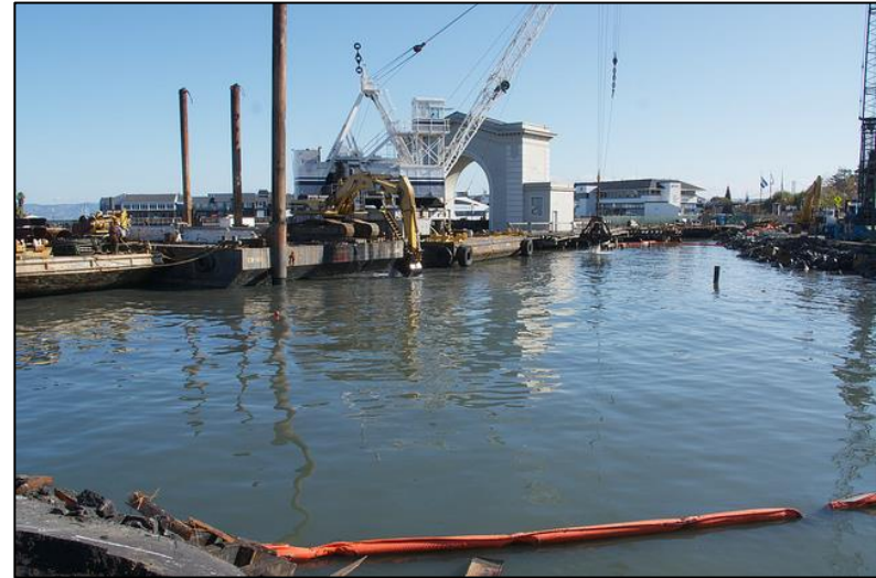
Photo: Pier 43-12 Sea Wall Repairs 11-2011