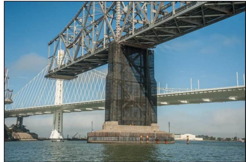
Photo: Old Bay Bridge & New Bay Bridge