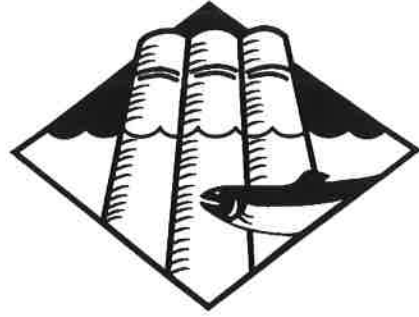
Fig. 1. BMP mark. This insignia is used by manufacturers of factory-preserved wood treated according to specifications set out in Best Management Practices for the Use of Treated Wood in Aquatic Environments (CITW and WWPI 1997).